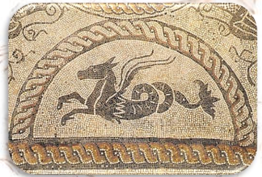
Mosaic Fishbourne Palace, Sussex, UK

My interest in mosaics was inspired by a visit to Ostia Antica, the old Roman city just outside Rome in 2006. Their existence today is both a testimony to the original makers and subsequent individuals throughout the centuries who ensured their endurance. The horse mosaic (below) from Fishbourne Roman Palace, Sussex, became a fascinating object and lesson in the survival of material culture. Later, back in England, I went on a mosaic-training course and afterwards, from a simple line drawing, created the card and the mosaic below. Later I used the idea of mosaic in a series of drawings called Horses Dancing (2003) by cutting up squares and triangles of coloured card to create mosaic areas along with the paint and pastel (example below). Later it came back to me that at primary school we had used this technique in art lessons.