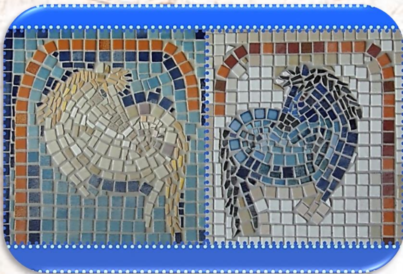
Horses Turning drawing (below) and mosaic diptych (above) 2011